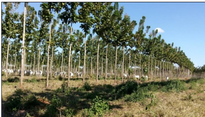
Figura 1. Sistema de integração Pecuária-Floresta, gado nelore e espécie teca, em uma das fazendas avaliadas. Figure 1. Livestock-Forest integration system, Nellore cattle herd and teak species, in one of the assessed farms.

In addition, the integration between livestock and forest creates a very complex production system, raising issues such as competition between teak and other surrounding plants, and the fact that falling leaves may hinder the growth of undergrowth/low-growing plants (DAMASIO et al., 2015). To alleviate such issues, each area should be analyzed to plan the best spacing arrangement between components and choose appropriate forages.