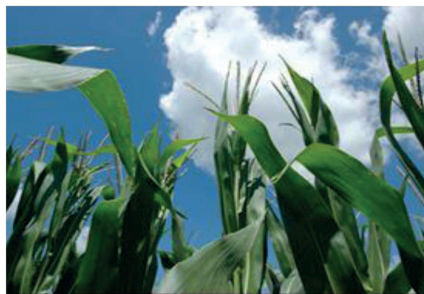
Figure 1. Maize plant in tasseling stage - Ritchie et al. (1993).

station installed 350 meters away from the experimental area) were recorded for the period from sowing to tasseling (50% of the plants with visible tassels), from tasseling to silking (50% of the plants with visible style-stigma), and from silking to physiological maturity, when there is formation of the black layer in grains (Figures 1 & 2). It was assumed that, as from the flowering stage, there is no longer stem and leaf growth, with emergence of kernels and their subsequent filling and loss of moisture.