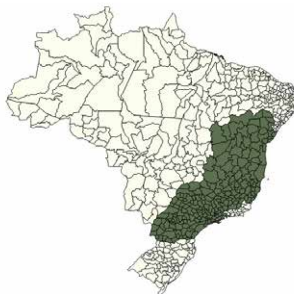
Figure 1. Microregions of the main coffee producing states in Brazil.

In order to reach the objectives, we used the techniques of Exploratory Analysis of Spatial Data (EASD), which make it possible to analyze