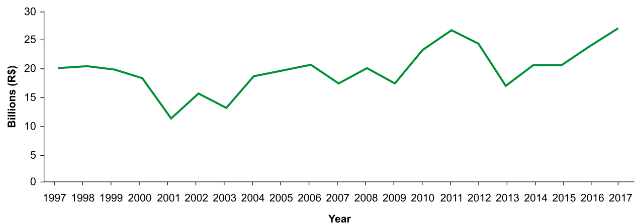
Figure 2. Coffee production (R$) between 1997 and 2017.

In order to better identify the relative position for which state and its evolution since 1980, Table 2 shows the relative participation of the six largest coffee producers in Brazil. We can note that even between the largest producers, the production is concentrated, which has increased in recent periods. We can highlight the Minas Gerais case, which held 19% in 1980, after São