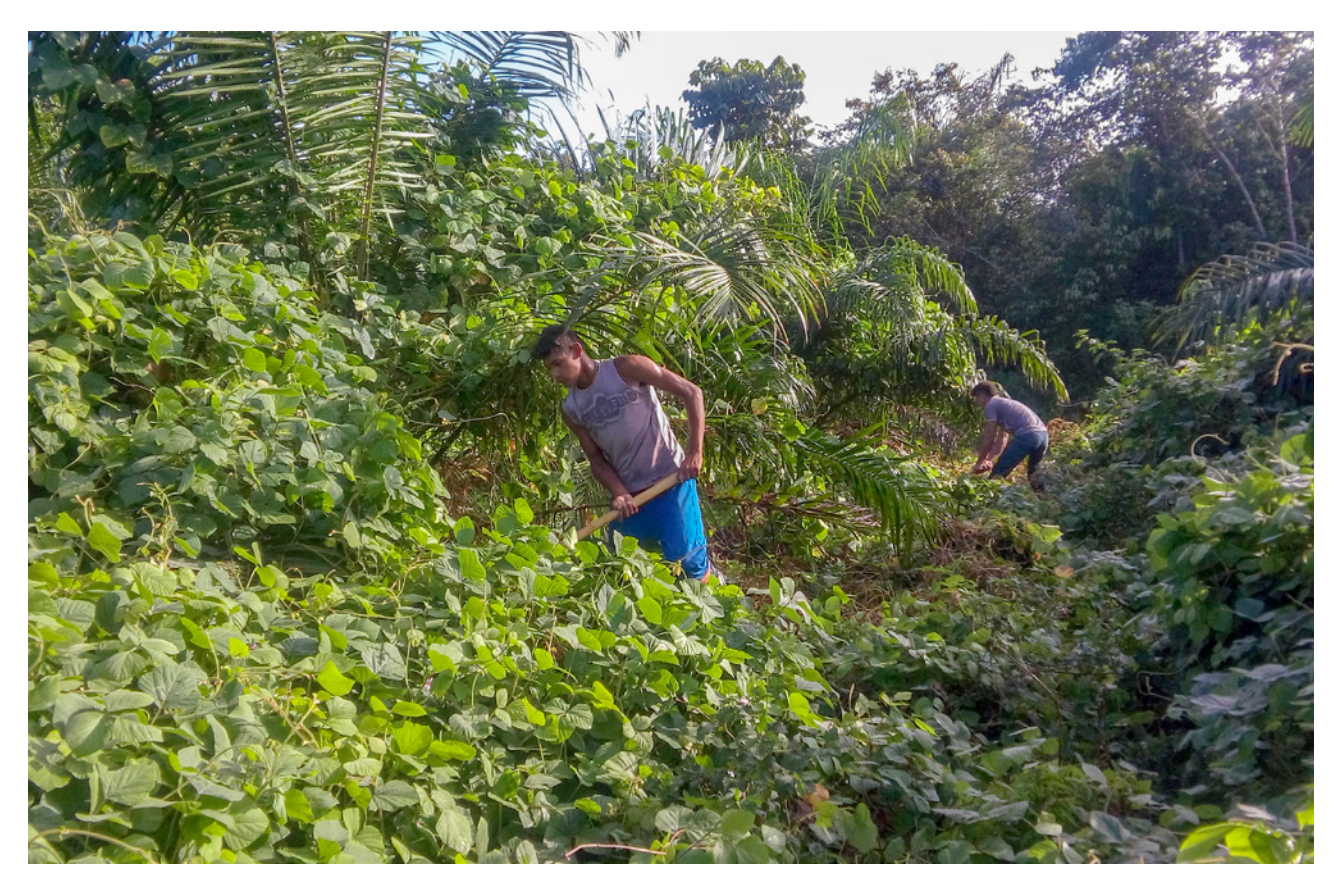
Young farmers weeding palm oil plantation.

agreements open other avenues once closed to them, such as rural financing, making it possible for them initiate their plantings, credit availability often made possible by public authorities who support oil palm initiatives. In summary, this data should be analyzed relative to the deprivations that farmers have historically faced, as most opted to plant oil palm in the hope of improved earnings, supported by rural credit. These decisions were made within the context of great public support for this crop, which benefited from prioritized resource allocation.