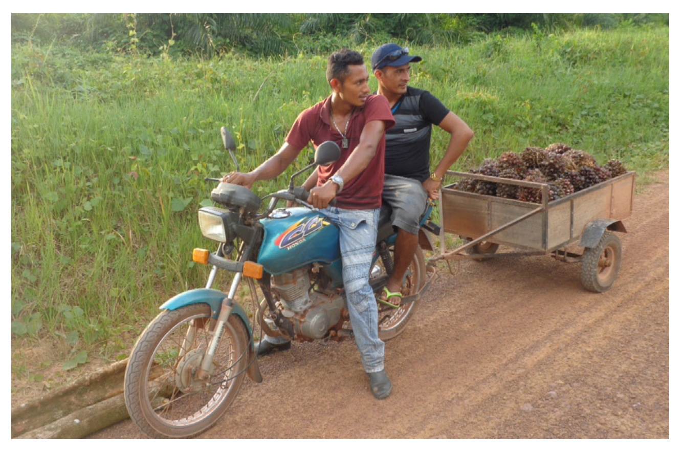
Oil palm fruits to be collected by the enterprise (point of concentration).

and Garrafão do Norte and half those from Moju are not yet in a position to repaying their loans. When repayments begin, satisfaction levels will probably change. This calls into question the adequacy of the model and its ability to improve the lives of contract farmers. A few farmers expressed their different perceptions on their experiences with oil palm contract farming.