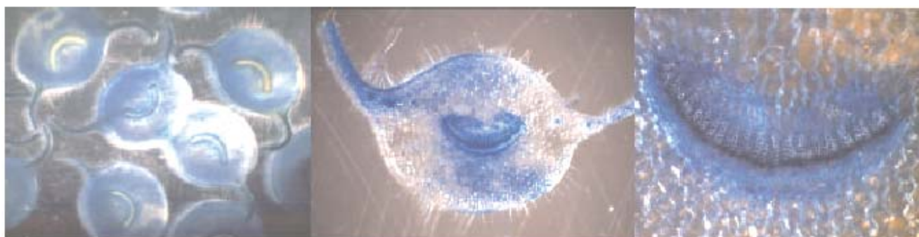
Figure 2. GUS staining of transverse sections of leaf petioles from CsPP-GUS transgenic tobacco.

Tobacco plants with the GUS gene driven by Arabidopsis sp. (Giacomin & Szalay, 1996) and bean