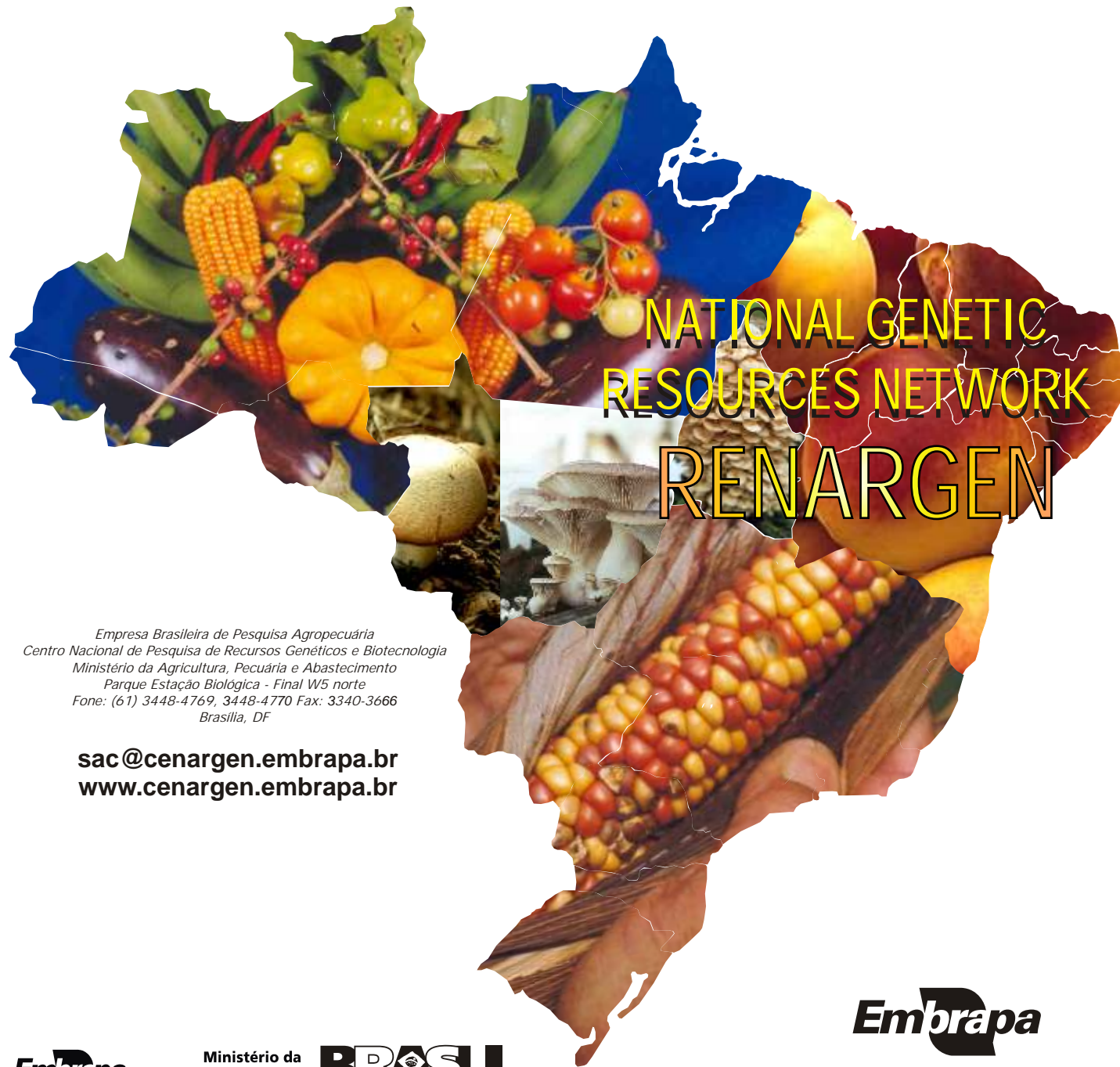
Distribution of the germoplasm banks linked to RENARGEN

The National Network of Genetic Resources has provided key support to the tremendous technological advances obtained by the Brazilian agriculture over the last three decades. It allowed the R&D system to incorporate and utilize genetic resources for development of plant cultivars, breeds of animals and strains of microorganisms of importance to the agroindustry and agrifood sectors in the country. Also, the Network has made significant efforts to raise the awareness of the Brazilian society in regard to the strategic importance of genetic resources and biodiversity for the country's future. Considerable efforts have been made to conserve and to promote the sustainable use of native plants of economic interest as well as to consolidate in situ and on farm conservation strategies, creating the basis for increasing income, food sufficiency and the aggregation of environmental and social values to traditional communities dependent on biodiversity.