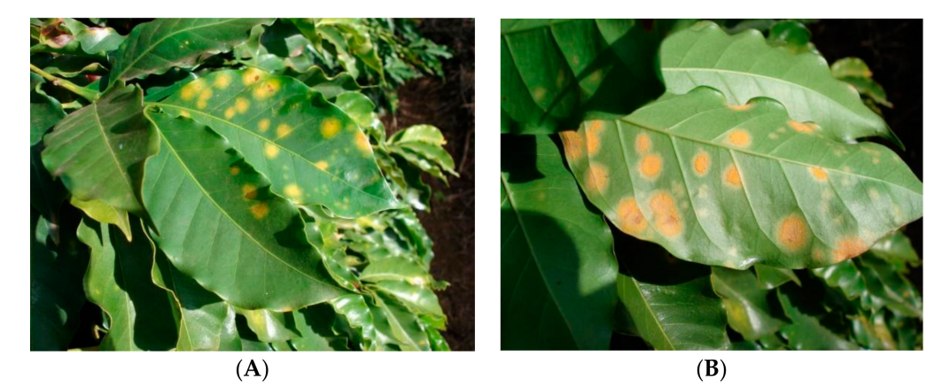
Figure 1. Coffee leaf rust symptoms and signs: ( A ) Chlorotic spots are visible on the upper leaf surface. ( B ) Chlorotic spots and urediniosporic sori on the lower leaf surface.

The first CLR symptoms are small, pale yellow spots, which gradually increase in diameter, preceding the differentiation of orange-colored uredinia on the lower leaf surface (Figure 1). During severe rust infection, the leaves become covered with pustules, inducing them to fall prematurely, which reduces plant photosynthetic area. Repeated infections debilitate the plant and can cause branch dieback [16,17].