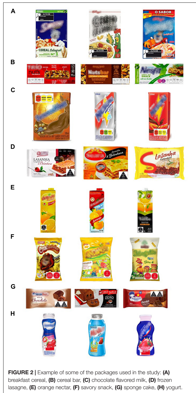
FIGURE 2 | Example of some of the packages used in the study: (A) breakfast cereal, (B) cereal bar, (C) chocolate flavored milk, (D) frozen lasagne, (E) orange nectar, (F) savory snack, (G) sponge cake, (H) yogurt.

The percentage of participants who selected each response option in the choice task for each of the product categories is shown in Table 3 . Results from the multinomial logistic regression showed