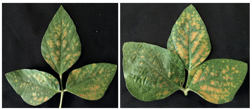
Figure 1. Soybean leaves with different stages of evolution of yellow leaf disorder symptoms, Londrina, state of Paraná, season 2010/2011.