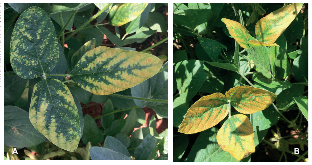
Figure 4. Soybean leaf with advanced symptoms of yellow leaf disorder observed in A. Rondonópolis, state of Mato Grosso and B. Ponta Grossa, state of Paraná.

In some particular situations, the symptoms of soybean yellow leaf disorder. initially characterized bv isolated and small spots, can evolve and take up a large part of the leaflets. That can confuse an observer less familiar with the phenomenon, inducing the person to confound it with other problems, including nutritional issues. An example of a possible evolution of symptoms is in Figure 4, with coalescent spots resulting in interveinal yellowing or browning of the edges of soybean leaflets.