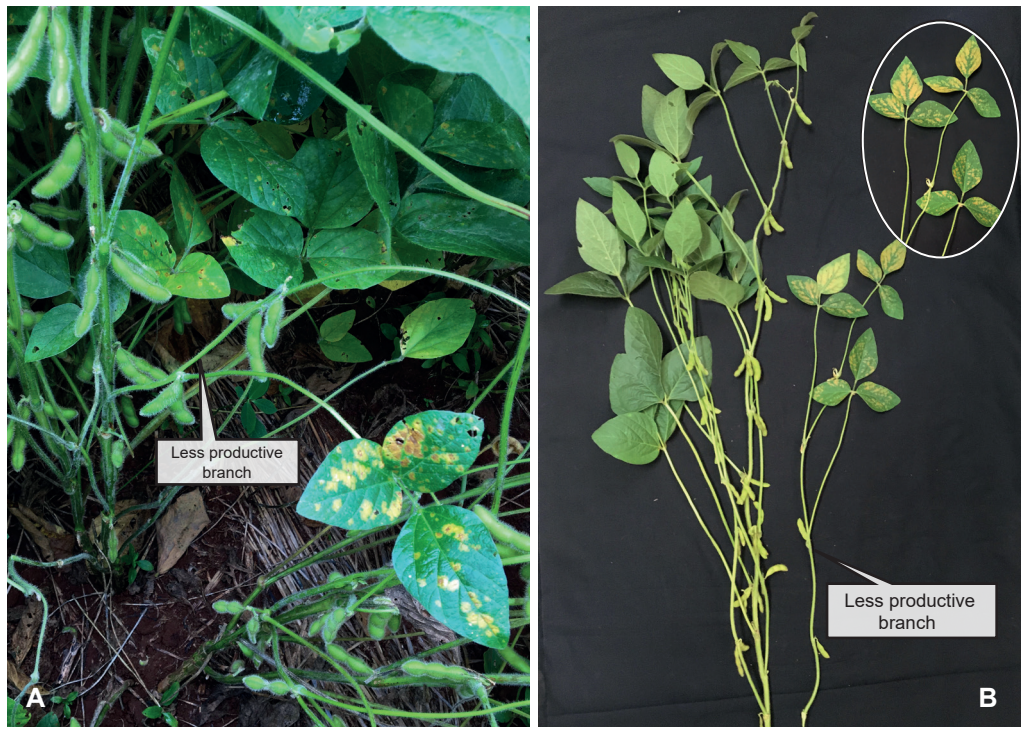
Figure 3. Soybean plants with yellow leaf disorder symptoms observed in two distinct edaphoclimatic regions. A. Palotina, state of Paraná; B. Londrina, state of Paraná.

crops, and it has been observed in several agricultural regions, in general, more frequently in areas with high yield potential. Since the symptom usually occurs on the leaves of poorly developed secondary branches, as if they were less productive or unproductive branches (Figure 3), mainly in the lower third of the plants, it is more easily observed when walking between the crop rows. That is, these leaves are hardly seen from a distance, and therefore the symptoms identification requires careful examination.