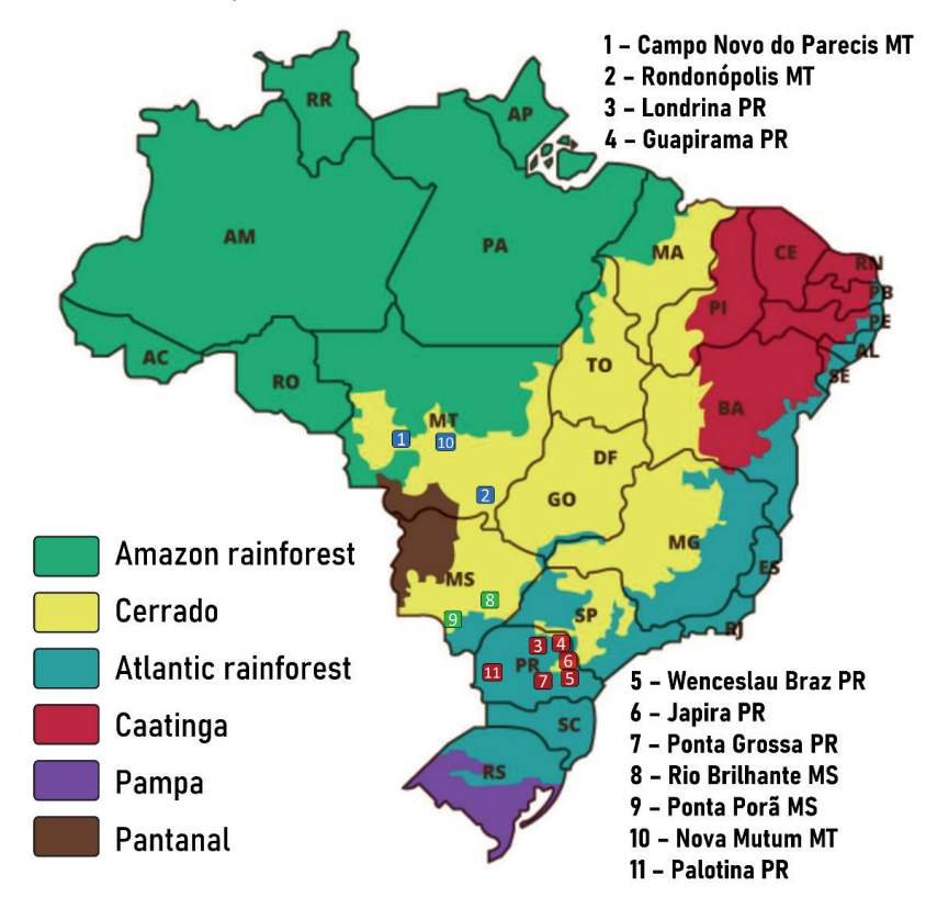
Figure 5. Map of Brazil with biomes and locations of municipalities where samples of soybean leaves with and without symptoms of soybean yellow leaf disorder were collected.

samples of soybean leaves with and without symptoms were collected, corresponding to the analyses presented in Table 1.