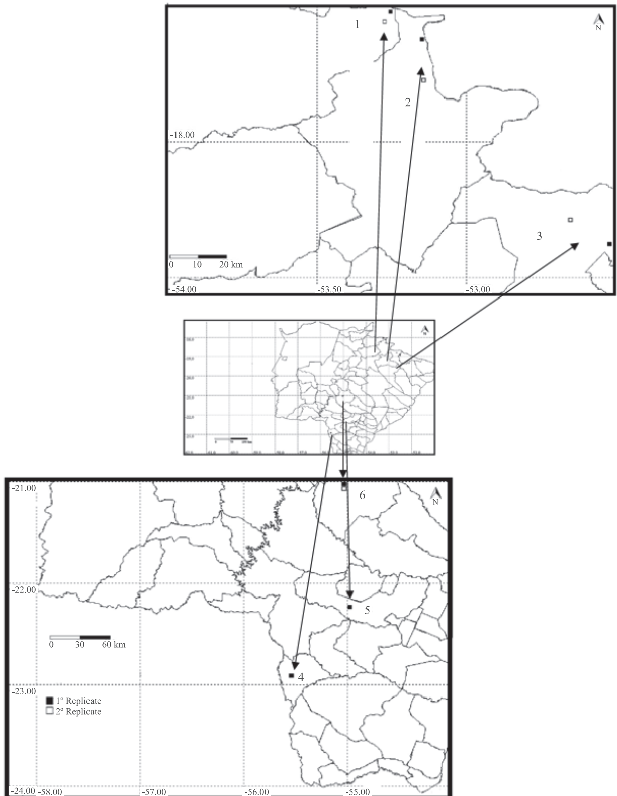
Figure 1. Map of the study areas in the state of Mato Grosso do Sul, Brazil, with the number of experimental replicates in 2015. The municipalities identified in the numerical sequence are: 1, Alcinópolis; 2, Costa Rica; 3, Chapadão do Sul; 4, Aral Moreira; 5, Dourados; and 6, Sidrolândia.