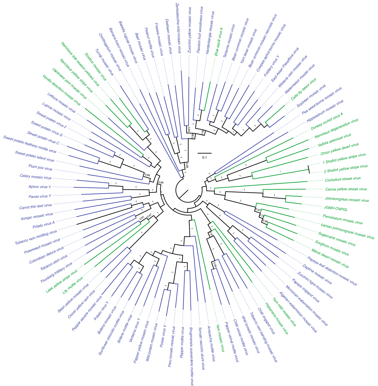
Fig. 2 Phylogenetic analysis using nucleotide sequences of the polyprotein region of potyviruses. The blue color indicates viruses that infect dicotyledonous plants, and the green color indicates viruses infecting monocots. The complete nucleotide sequence of JGMV-

CNPGL ORF1 was aligned with other potyvirus sequences (Supplementary Table 1) using the translation alignment tool implemented in Geneious 9.1. The phylogenetic tree was inferred using the FastTree algorithm implemented in Geneious 9.1 (color figure online)