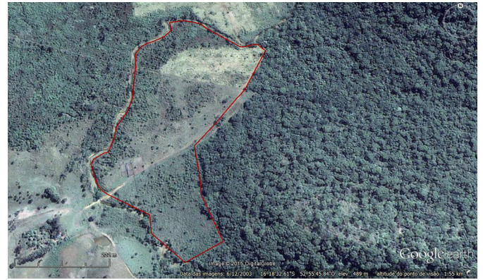
Fig.1. Independence Farm, Torixoréu, Mato Grosso, Brazil. (A) Green Niederzuehella stannea in a pasture of dry Brachiaria spp. (B) Cattle consuming leaves of N. stannea in August 2013. (C) Sprouts of N. stannea . (D) Flowers and fruits of N. stannea .

Inspection of the pastures was performed on 80 farms in the municipality of Torixoréu, Mato Grosso. The aim