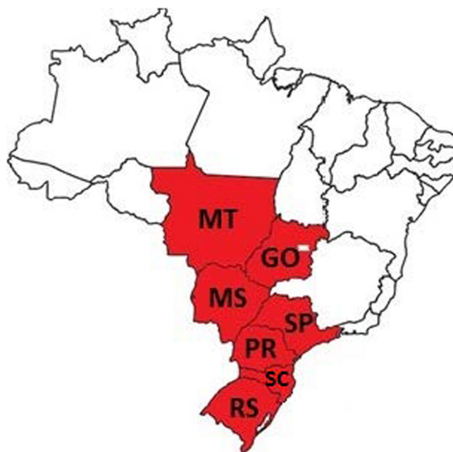
Fig.1. Areas in red represent the states in which are located the intensive pig farms sampled for analysis.

Among the 1,940 pig blood samples collected, 1,594 were taken from bleeding procedure at slaughterhouses in the region of Jaboticabal, São Paulo, coming from seven different states (RS, SC, PR, SP, MT, MS, GO), in a total of 30 intensive pig farming, as seen in Figure 1 and Table 1. The other 346 blood samples were from 56